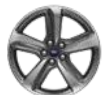
18" BRIGHT-MACHINED ALUMINUM WITH PREMIUM DARK STAINLESS-PAINTED POCKETS 3 Optional; includes snow chain-compatible tires