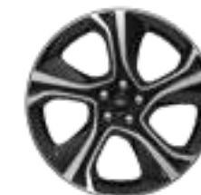
20" BRIGHT-MACHINED ALUMINUM WITH HIGH-GLOSS BLACK-PAINTED POCKETS Standard