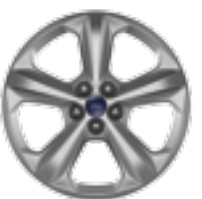
18" SPARKLE SILVER-PAINTED ALUMINUM Standard