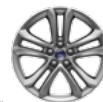
18" SPLIT-SPOKE SPARKLE SILVER-PAINTED ALUMINUM Standard