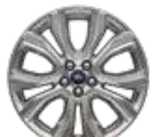
19" LUSTER NICKEL-PAINTED ALUMINUM Standard