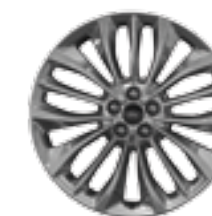
20" POLISHED ALUMINUM Standard

LEATHER-TRIMMED SEATING SURFACES: Ebony/Brunello