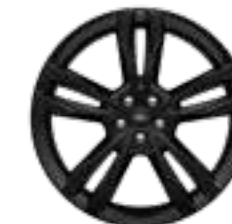
21" PREMIUM GLOSS BLACK-PAINTED ALUMINUM Optional; included with ST Performance Brake Package