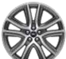
20" BRIGHT-MACHINED ALUMINUM WITH PREMIUM DARK STAINLESS-PAINTED POCKETS Optional on 300A