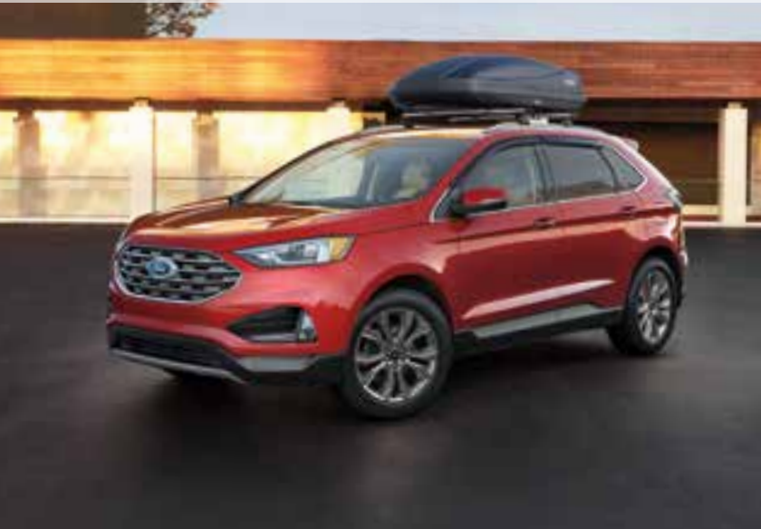
Titanium in Rapid Red Metallic Tinted Clearcoat accessorized with smoked side window deflectors, 1 front and rear molded splash guards, roof-mounted crossbars and cargo box, 1,2 and wheel lock kit