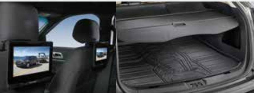
Rear Seat Entertainment System 1