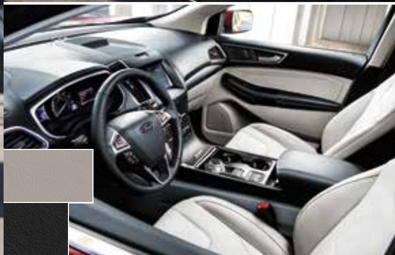
LEATHER-TRIMMED SEATING SURFACES: Medium Soft Ceramic, Ebony

Available equipment shown. 1 Metallic. 2 Additional charge. 3 Restrictions may apply. See your dealer for details. 4 Certain restrictions, 3rd-party terms and data rates may apply. See footnote 1 on the "Your Tech, Your Way" pages, and your Ford Dealer for details. 5 Ford Licensed Accessory.