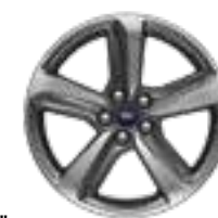
18" BRIGHT-MACHINED ALUMINUM WITH PREMIUM DARK STAINLESS-PAINTED POCKETS Optional