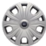
16" Steel with Full Sparkle Silver-Painted Covers Standard: XL, XLT