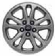
16" Sparkle Silver-Painted Aluminum Optional: XLT