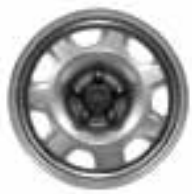
16" Shadow Silver-Painted Styled Steel Optional: XL