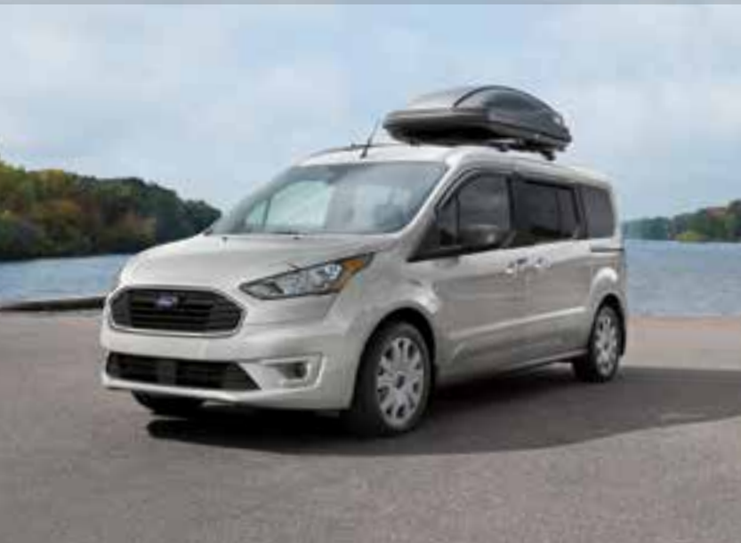
Passenger Wagon XLT in Silver accessorized with keyless entry keypad, side window deflectors, 1 molded splash guards, and roof crossbars and cargo box. 1,2