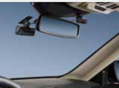
Dash cam systems 1

SHOP THE COMPLETE COLLECTION | accessories.ford.com