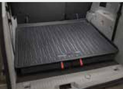
Cargo area protector