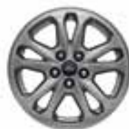
16" Sparkle Silver-Painted Aluminum Available: XL, XLT