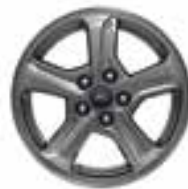
16" Premium Dark Stainless-Painted Aluminum Standard: TITANIUM