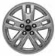
16" Premium Luster Nickel-Painted Aluminum Optional: XL, XLT